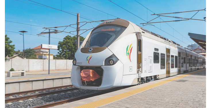
The Regional Express Train links Blaise Diagne International Airport and Diamniadio.

Nations House, modern sports facilities and more.