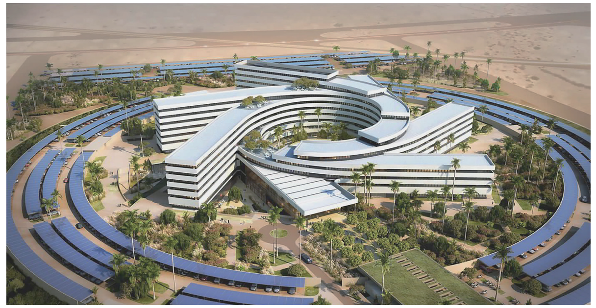
Located in the new city of Diamniadio, the United Nations House, with its striking helical architecture, houses 34 U.N. agencies. EMBASSY OF SENEGAL

Since 1993, Japan and Africa established, through the Tokyo International Conference on African Development process, a unique partnership covering various priority sectors for African development. More than three decades later, TICAD's overarching priority has been redefined, as strengthening the economic relations between Japan and the African countries is now top on the agenda.