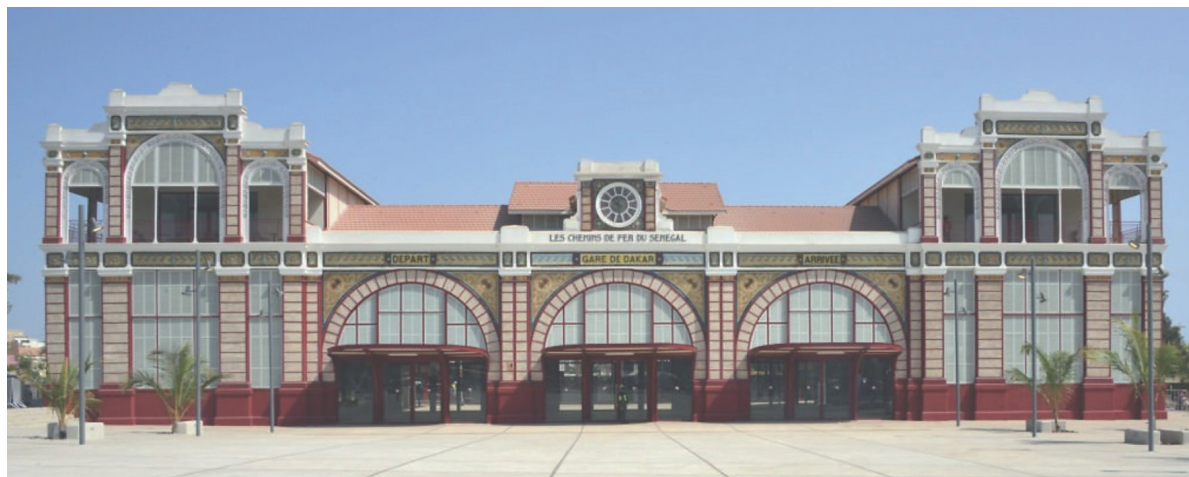
Far left: Traditional Senegalese clothing features bright colors and animal prints. Dakar train station has a neoclassical art deco-inspired design and is classified as a national historical monument. EMBASSY OF SENEGAL

Congratulations to the People of the Republic of Senegal on the Anniversary of Their Independence